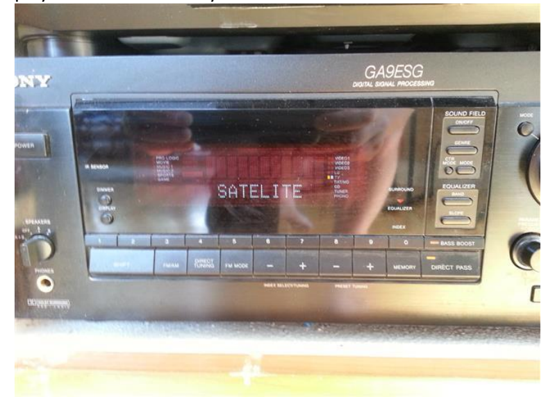
That's it. It should work. Change the channels using the DirectTV remote and enjoy.

Use the large knob on the right of the SONY receiver to adjust the volume. Use the large knob on the left of the SONY receiver to change from SATELLITE to DVD, if you want to play a DVD. It should say "SATELLITE" for the Direct TV to work.